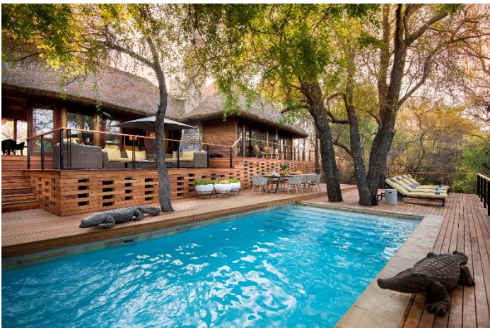
Morukuru River House

Morukuru Family welcomes children of all ages. We have based our whole ethos around hosting families or groups of close friends. Our junior guests are allowed on game drives throughout the Madikwe Game Reserve and are able to enjoy every magical aspect of being on safari with their parents. Children receive a Morukuru Kidz Backpack filled with Safari treasures. Children are kept busy with baking, kiddie-adventures, swimming, fishing and much more. We offer babysitting service as well.