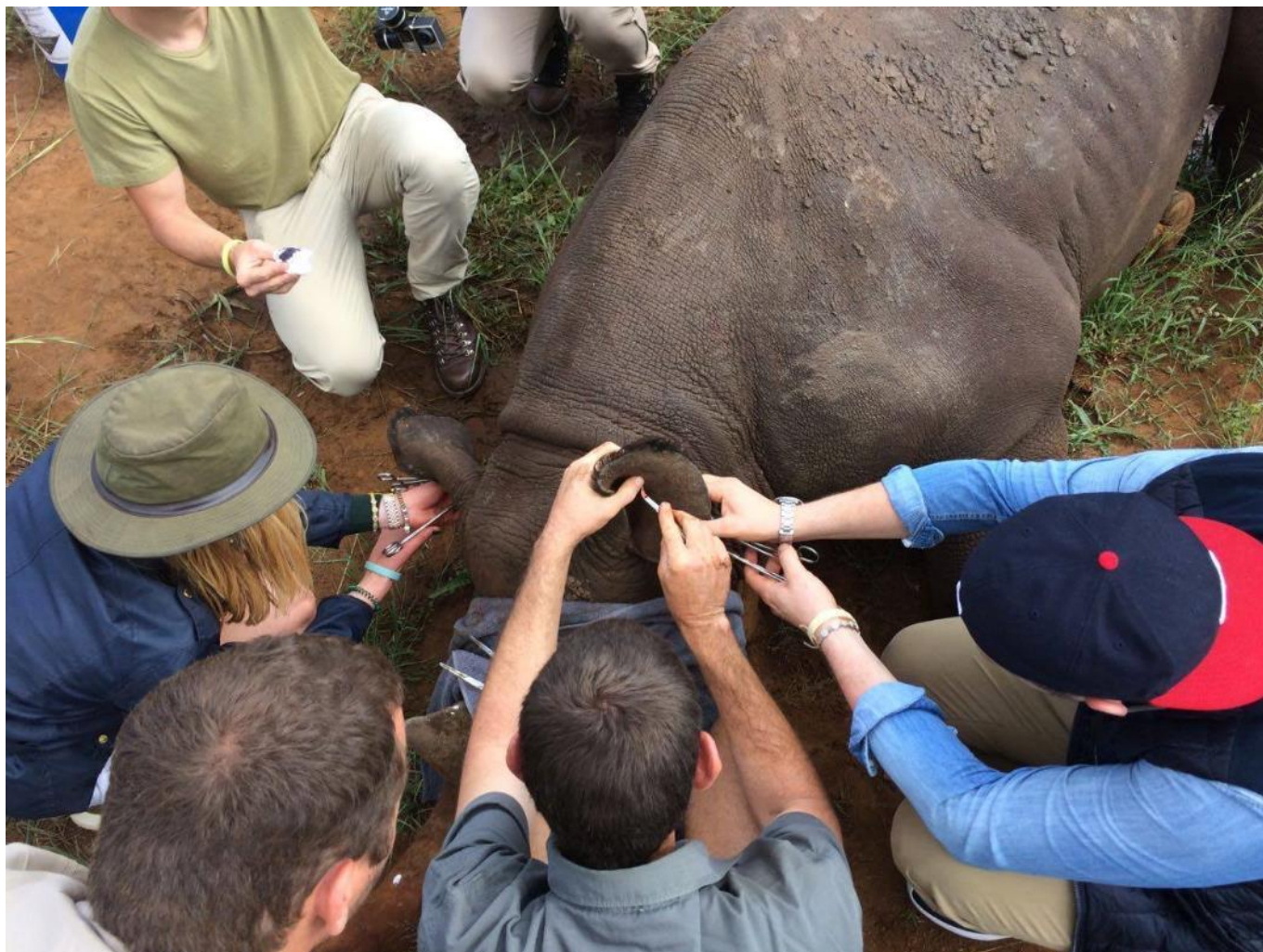
Rhino notching procedure

Afterwards you will enjoy a nice breakfast (at the house or in the bush) and you will have time to relax and enjoy the pool. In the afternoon you will enjoy lunch and another afternoon game-drive , followed by dinner.