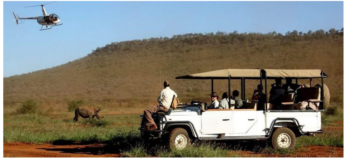
3-days 'Safaris with a Purpose' package 2023 Madikwe Game Reserve – South Africa

Are you keen to go on safari in Africa as a family, a group of friends or perhaps even as a corporate getaway? And you would like to give back to nature conservation and to the local community during your stay?