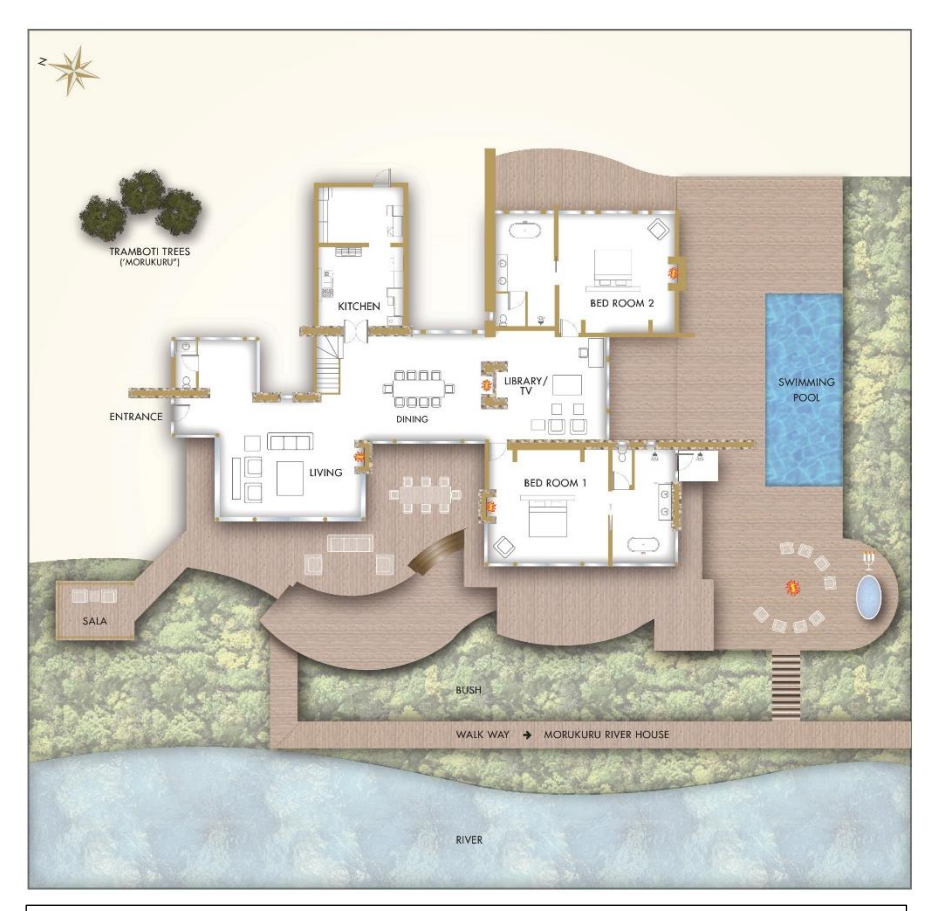
Owner's House – 310 m<sup>2</sup> Bedroom sizes (including bathroom) – 52 m<sup>2</sup>