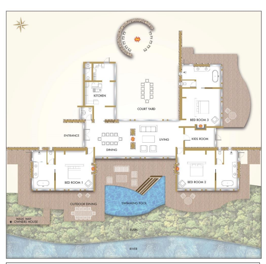
River House – 320 m<sup>2</sup> Bedroom sizes (including bathroom) – 52 m<sup>2</sup>