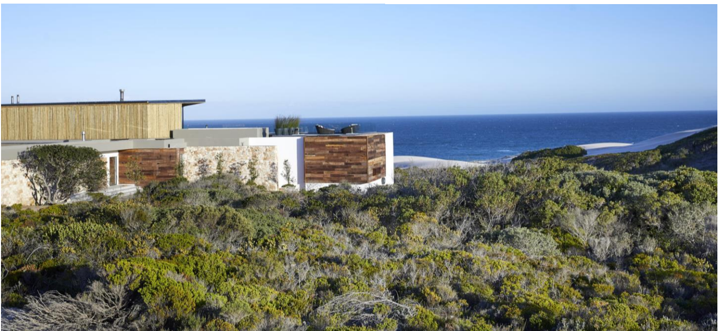
Morukuru Beach Lodge site and view