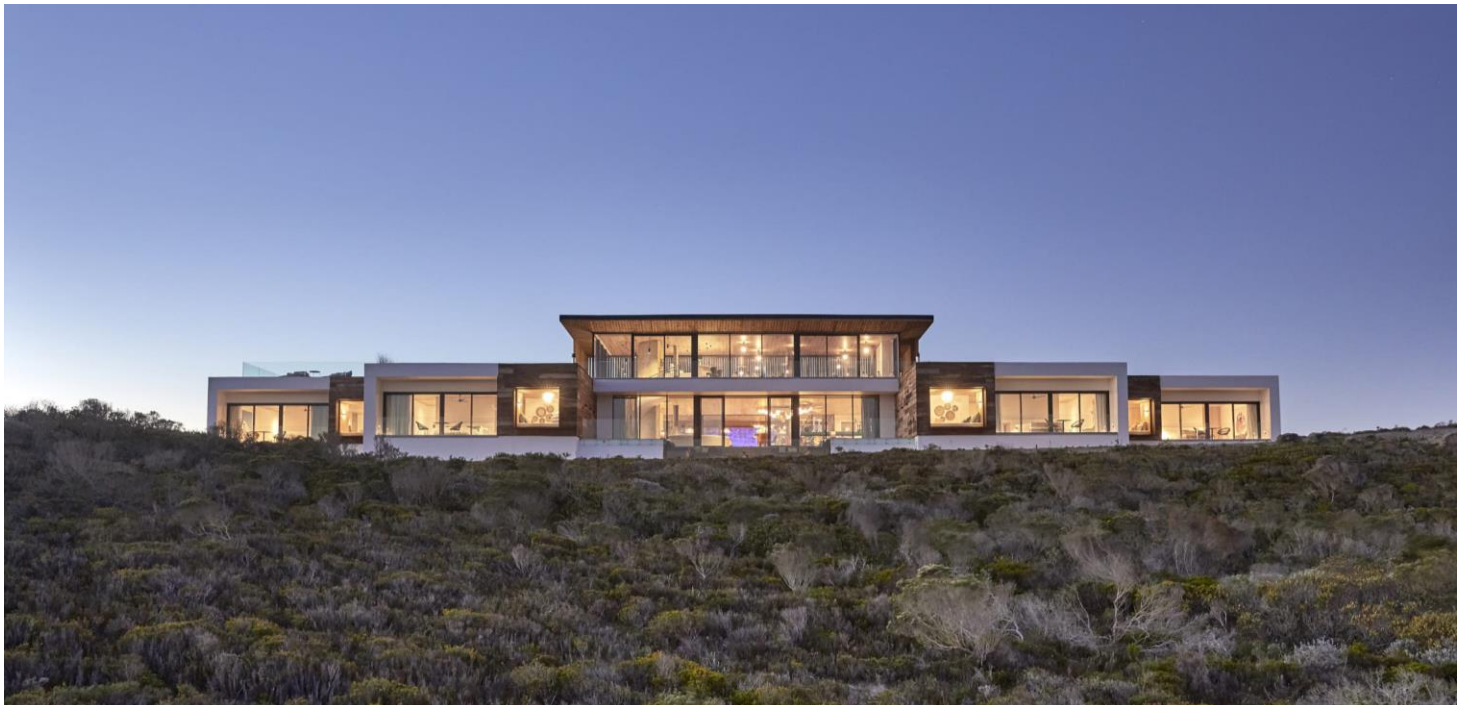
Morukuru Beach Lodge, surrounded by Fynbos