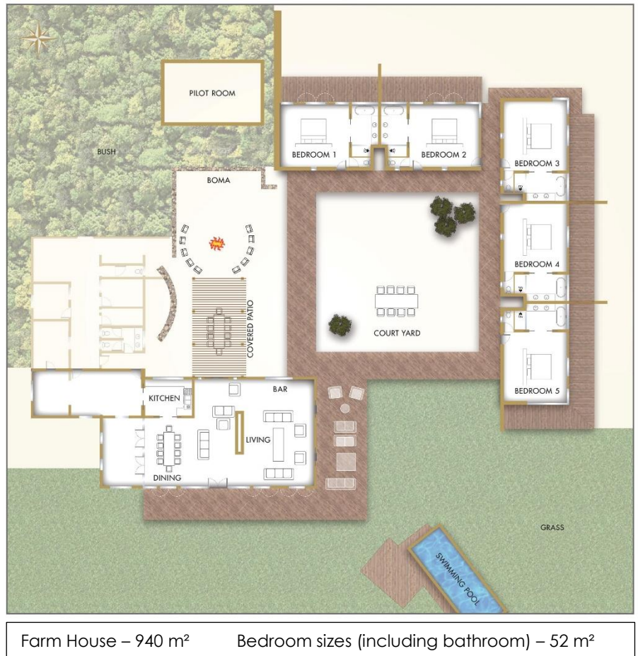
Farm House – 940 m 2 Bedroom sizes (including bathroom) – 52 m 2