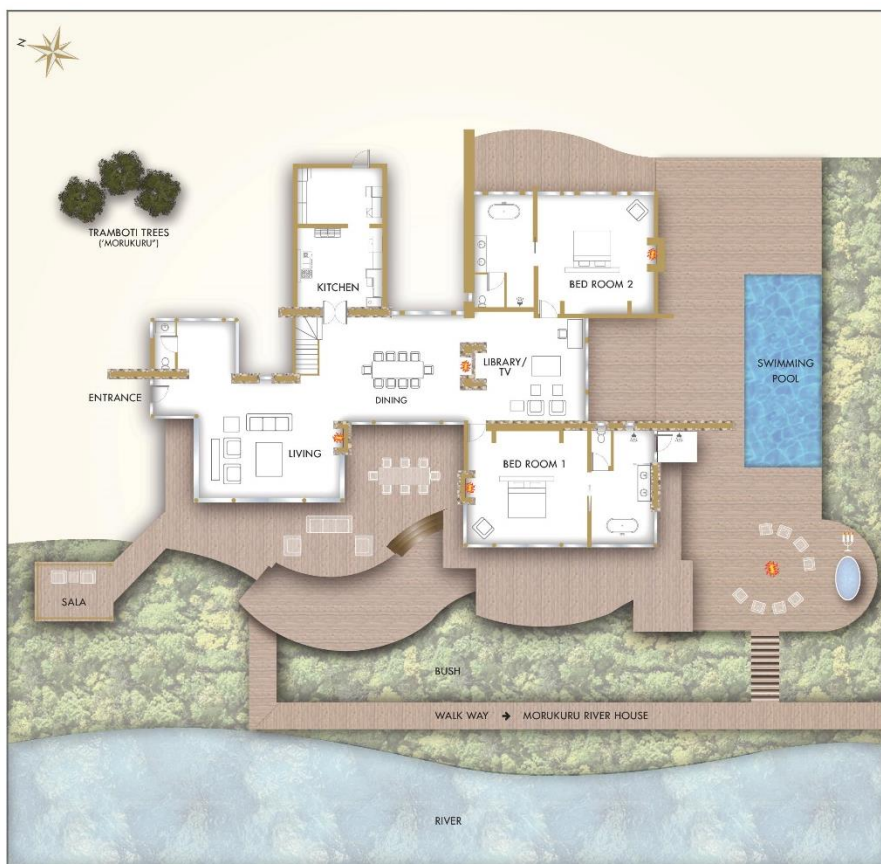
Owner's House – 310 m 2 Bedroom sizes (including bathroom) – 52 m 2