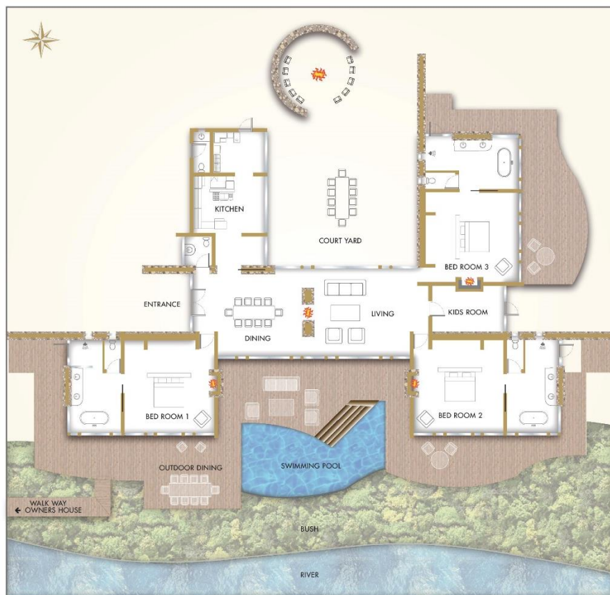
River House – 320 m 2 Bedroom sizes (including bathroom) – 52 m 2