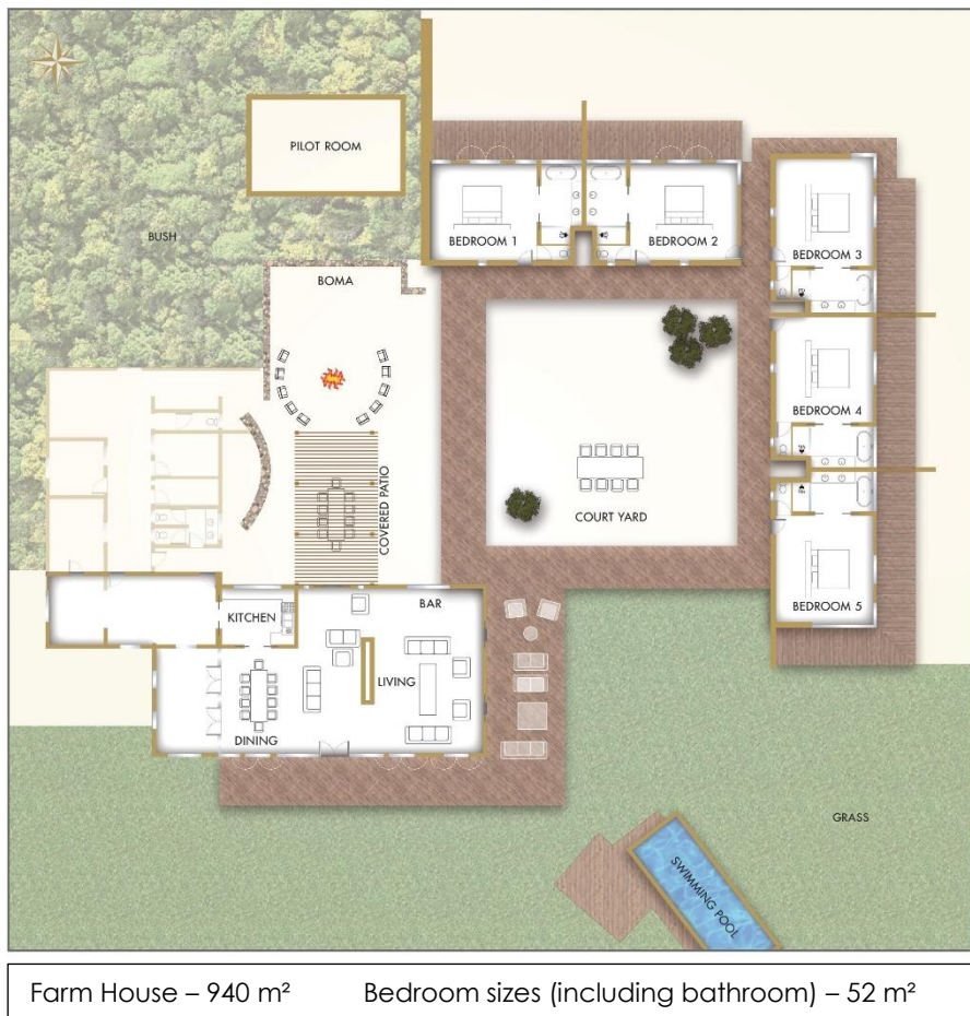
Farm House – 940 m 2 Bedroom sizes (including bathroom) – 52 m 2